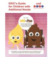
Guide for Children with additional needs