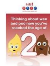
Thinking about wee and poo now you've reached the age of

Toileting session is due to be held soon- expect an invite if this applies to you.