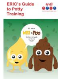
Guide to Potty Training