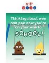
Thinking about wee and poo now you're on your way to school!