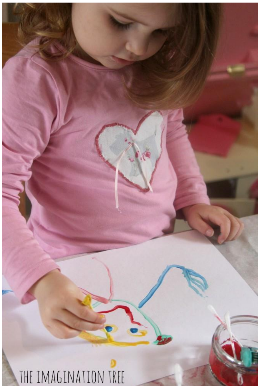
Tape resist paintings