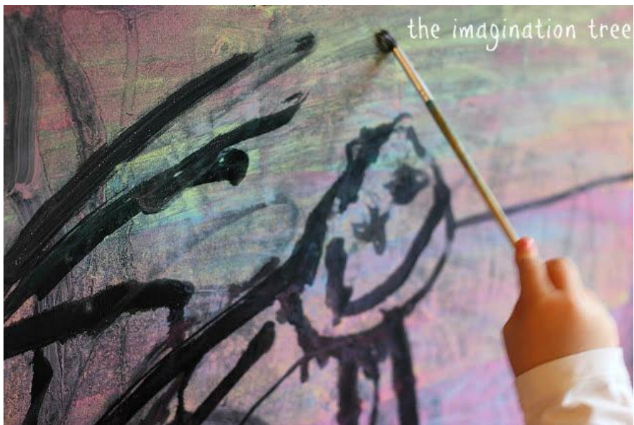
Finger paint mono-printing