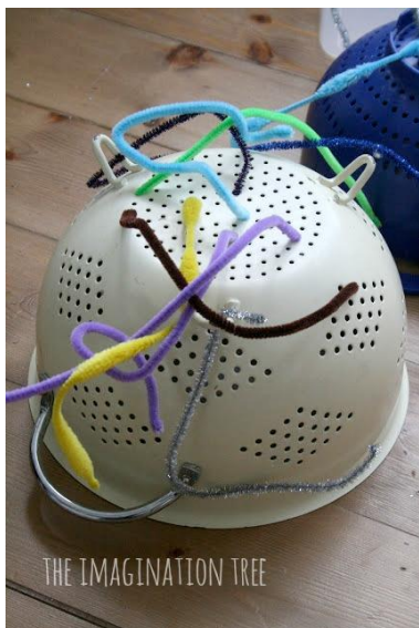
Beads on spaghetti