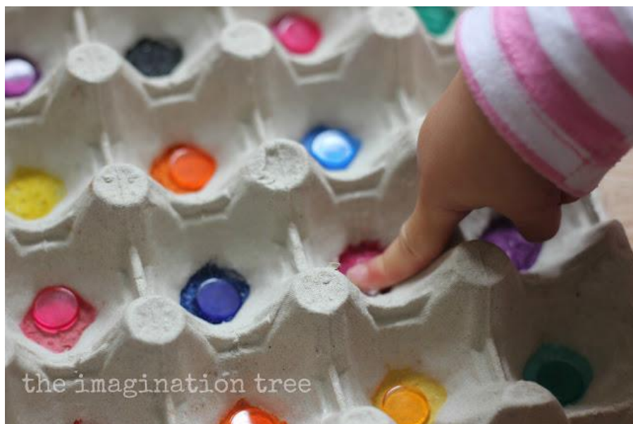
Tearing and sticking collage